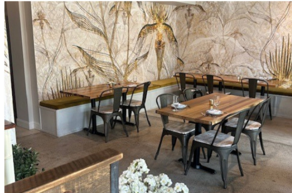
Our new dining space is modern but elegant.

The ALLoRA family of brands has reimagined their culinary legacy, consolidating over three generations of restaurants into two thriving establishments both under one roof.